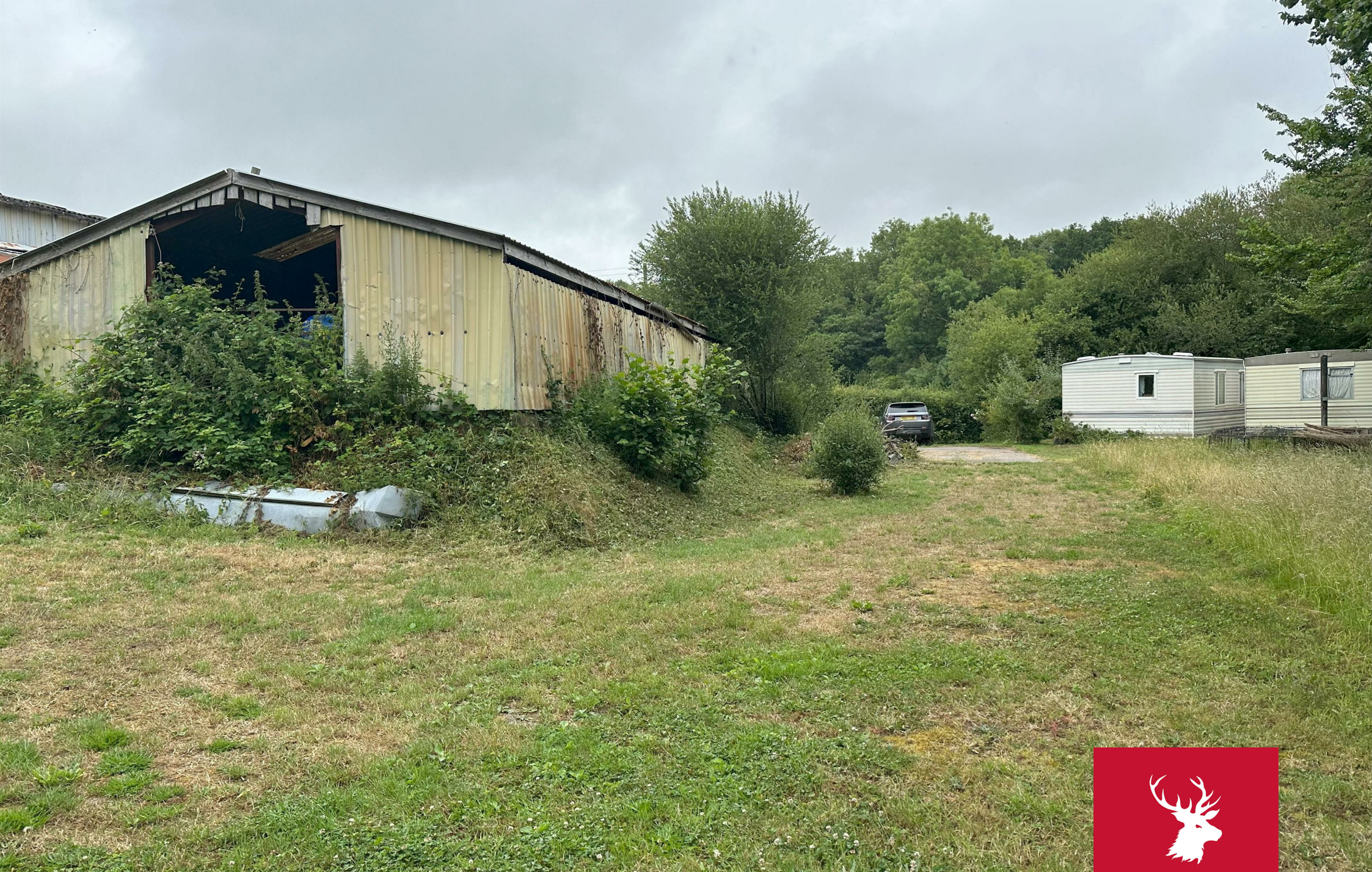
Barns and Caravan at Hornshayes Farm